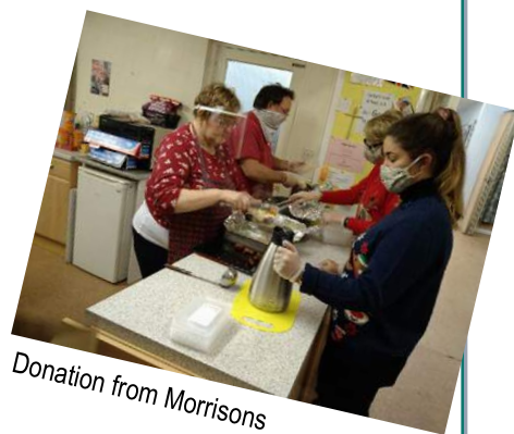
Donation from Morrisons