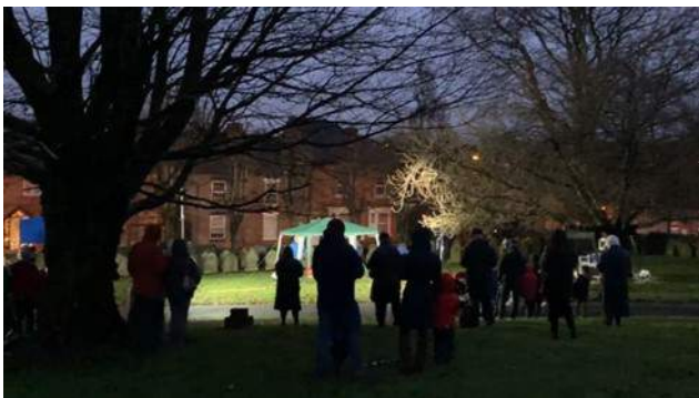
Outdoor Carol Services in the Wind and Rain at St Marks and the Biting Wind at Bretby.

We also held a Carol Service in the churchyard for church members and anyone in the Community passing by.