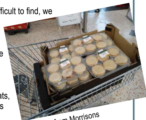
Donation from Morrisons