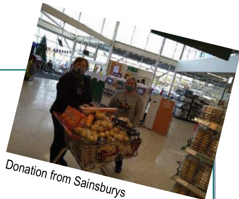
Donation from Sainsburys

Finally many thanks to our wonderful volunteers who came and prepared, cooked, served and delivered the meals.