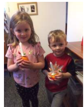
Look what we made.

We also held a Carol Service in the churchyard for church members and anyone in the Community passing by.